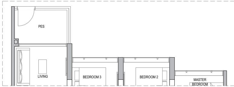
TYPE CY4-P Area: 93 sq m / 1001 sq ft Block 33 #01-20